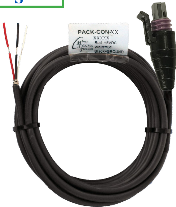
Part # PACK-CON-XXX (specify footage in part#)